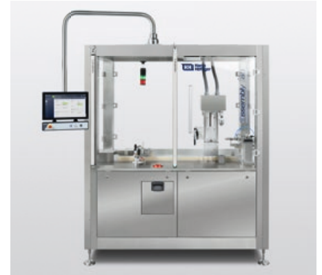
The Assembly Lab complements the technology portfolio at Experic.

State-of-the-art dosing equipment from Allmersbach im Tal has been in place for capsule filling and micro-dosing since the Experic facility was commissioned in July 2019. For Harro Höfliger, the cooperation with Experic