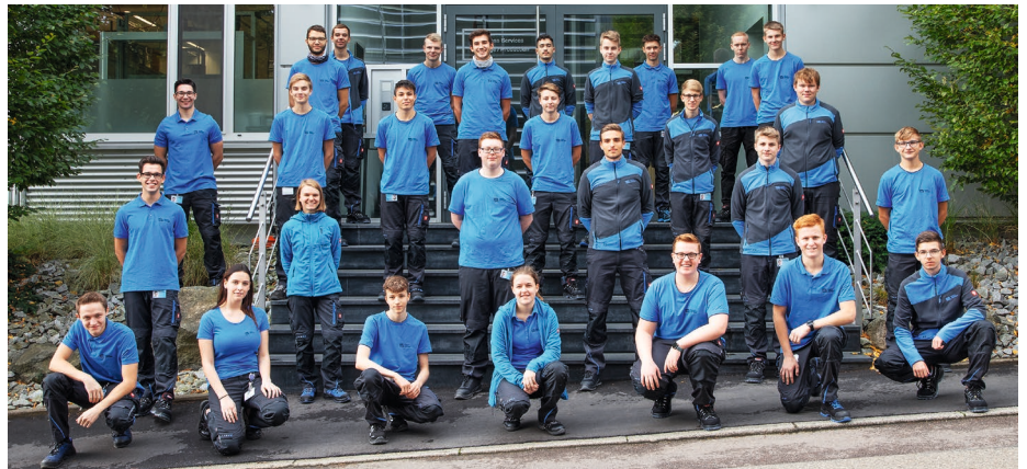
26 apprentices and 11 students of degree programs started their training at Harro Höfliger.

T his fall, 26 apprentices and eleven students at the Baden-Württemberg Cooperative State University (DHBW) started their working lives at Harro Höfliger. For almost 40 years, vocational training of our next-generation professionals has been an integral part of the company. During this time, over 500 employees have successfully completed their professional training. The skills in metal processing and electronics and control technology for mechanical engineering are taught intensively in our own training center, the HH Academy. Degree programs range from mechanical engineering, electrical engineering and information technology to international techni-